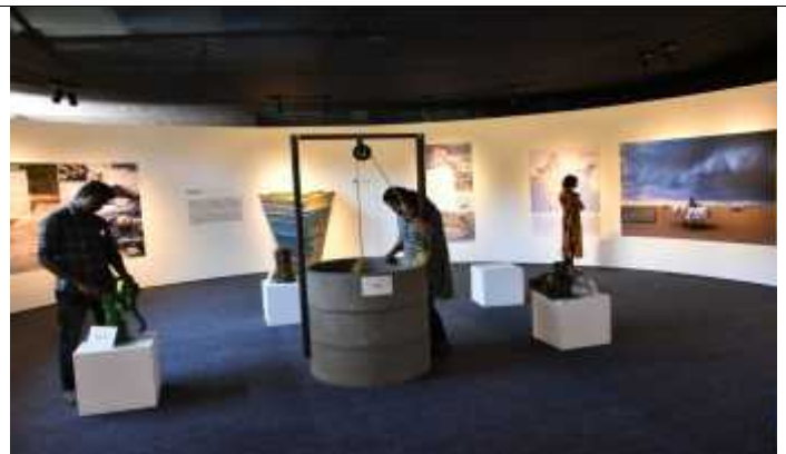
Demo at the event - 2