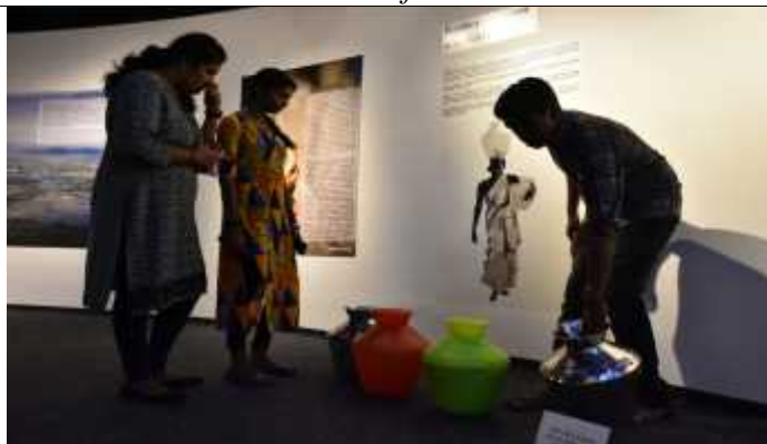
Demo at the event - 1