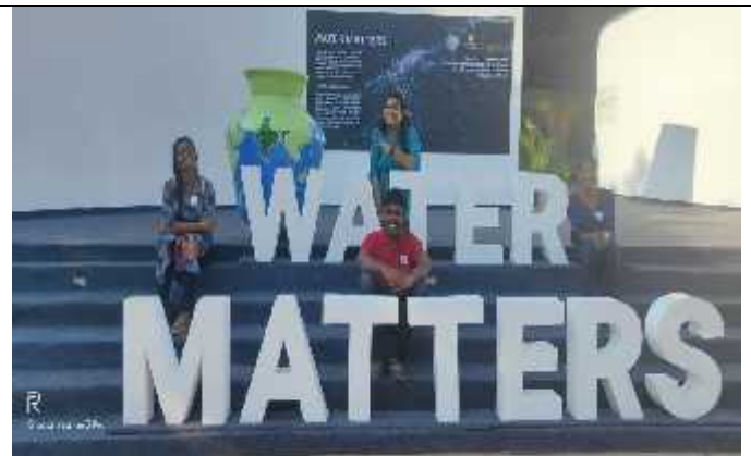
Students of Dept. of GT&TM at the event