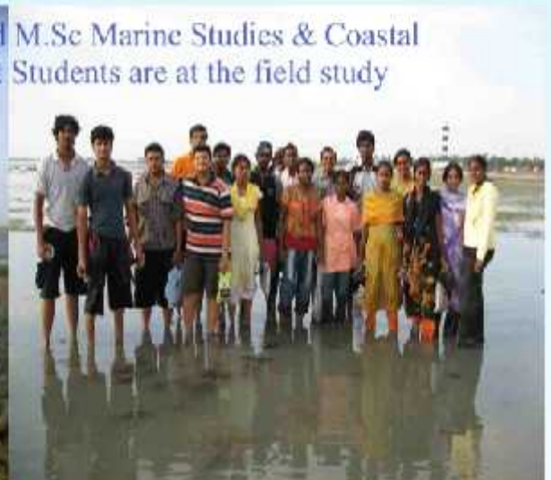
Student Projects at EBL