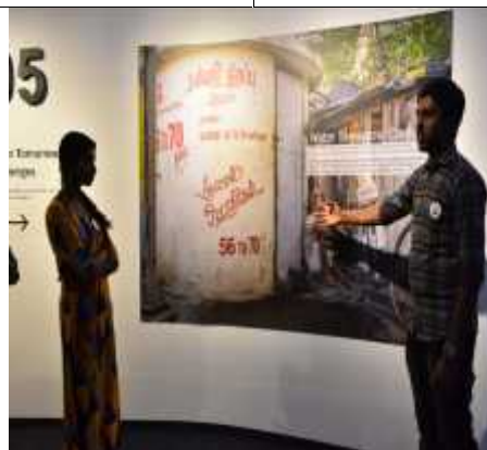
Demo at the event - 4