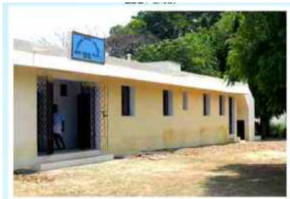
Estuarine Biological Laboratory