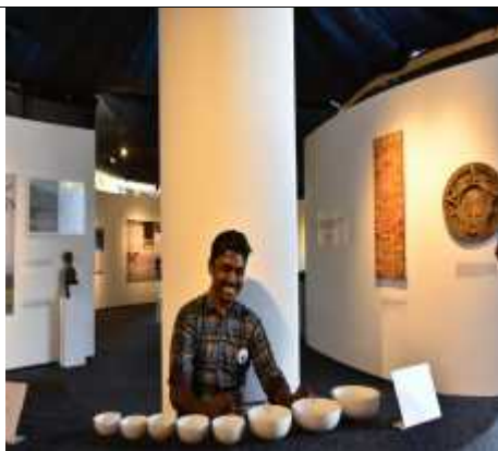
Demo at the event - 3