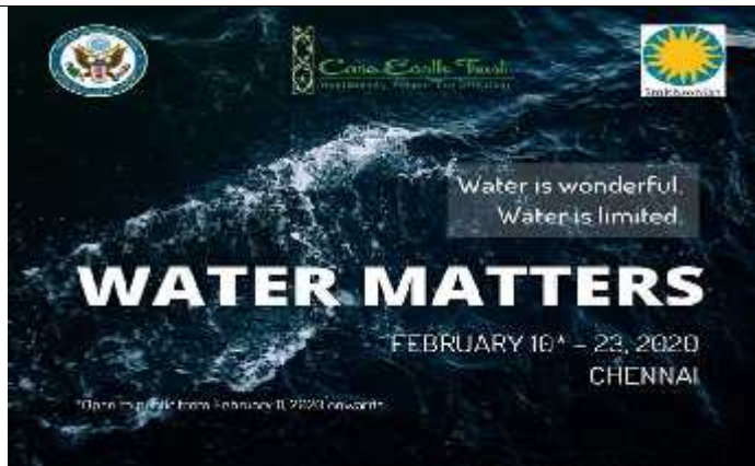
Poster for the event

Water matters is the collaborative project with US Consulate General Chennai, Care Earth Trust and Smithsonian Institution that aims to generate the general awareness on importance of managing water efficiently and promoting sustainable environmental practices. Curated by the US, Indian, International experts in Ecology, History and Heritage International Institution expertise from Smithsonian, Water matters explores the centrality of water in people's life by examining water as both an environmental necessity and key cultural element.